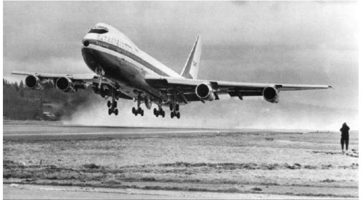
The 747's First Flight – "City of Everett"

In 1966, Pan American Airway ordered 23 passenger and two freight jumbo jets for $US550 million, and Boeing got to work. The company built the largest building in the world by volume in Everett, WA to construct the 747. Joe Sutter, who died in 2016, led the engineering team that designed the Boeing 747 in the mid-1960s. It took 50,000 employees to bring the plane to life. Boeing says it took 29 months from "conception to rollout," which earned the team the nickname "The Incredibles." The design required 4.5 million parts, used 75,000 engineering drawings, and built on the high-bypass engine technology that had been developed for the C-5A gigantic military transport plane. The original 747 had a 195-foot, 8-inch wing span and a swept-wing design that set the wings at 37 degrees for high cruising speeds over long distances. It weighed in at 735,000 pounds, twice the previous Boeing 707 model.